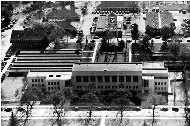
Aerial view of Shields Library ca 1955

the modern University Library. In 1908 a library room was established in the Creamery Building at the new University Farm. Photographs from the University Archives Photograph Collection show