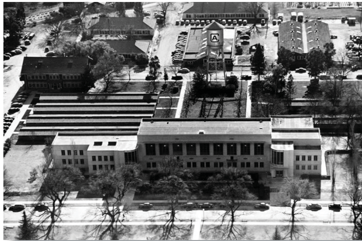
Aerial view of Shields Library ca 1955

In addition to a timeline, a wonderful gallery of photos showing Library facilities and collections over the years can be found at this site.